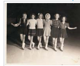
1944 - Tulsa FSC Intermediate Ladies

Ice Travaganza show was a recognized success.